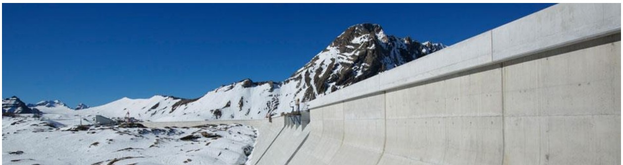
The Dam of the aXPo Linthal Hydro-electric plant in the Glarus Alps

The Ethereum Project is a Swiss founded crypto-programming platform and eco-system, with its own crypto-token, Ether (ETH). Second only to Bitcoin in market cap and popularity, Ethereum has conquered the crypto-world since its genesis launch in 2015.